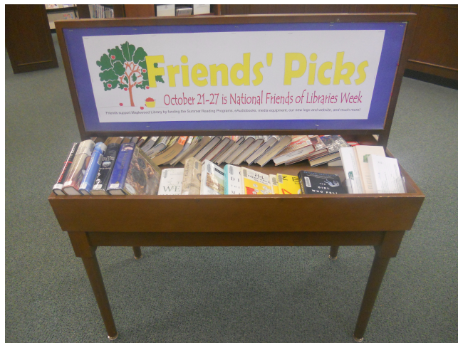
"Friends Picks" book display at Main